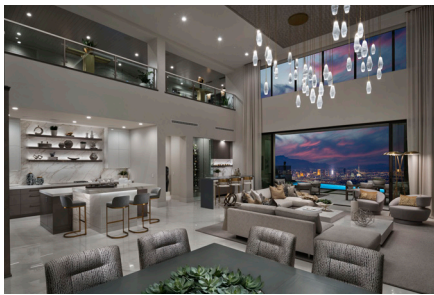
Best Architectural Design SkyVu Peninsula 2024

THESE ARE JUST A FEW OF THE OVER 150 AWARDS AND RECOGNITION THAT CHRISTOPHER HOMES HAS RECEIVED TO DATE FOR THEIR DESIGN ACUMEN AND QUALITY CONSTRUCTION.