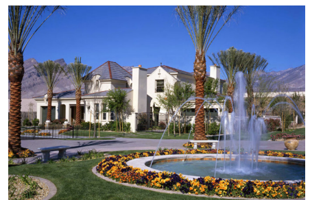
Best Community in the Nation 2004, 2002, 2000