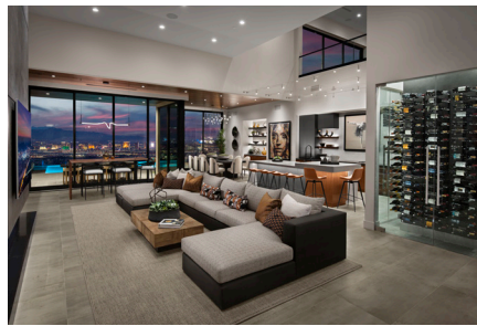
Best Interior Design SkyVu Montage 2024