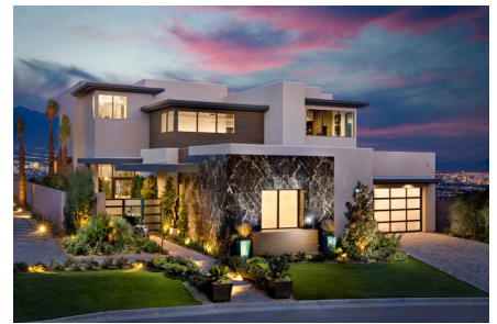
Best Architectural Design SkyVu Montage 2024