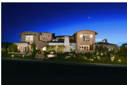
Best Home in the Nation 2005, 2004, 2002, 2000, 1999