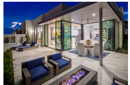
Best Architectural Design Vu Residence 3 2018