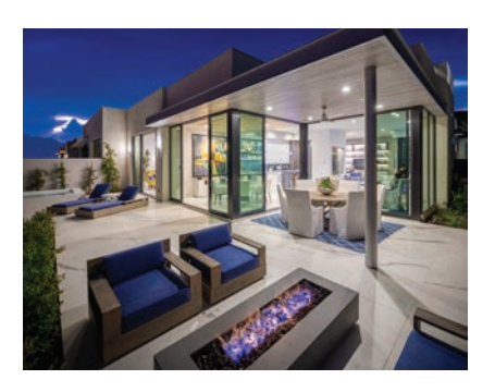
Best Architectural Design Vu Residence 2018