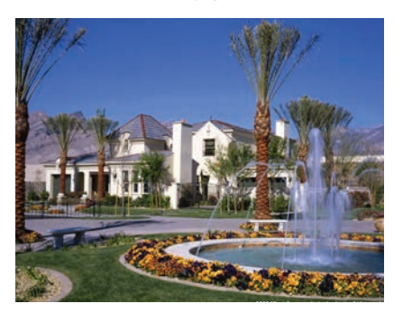
Best Community in the Nation 2004, 2002, 2000